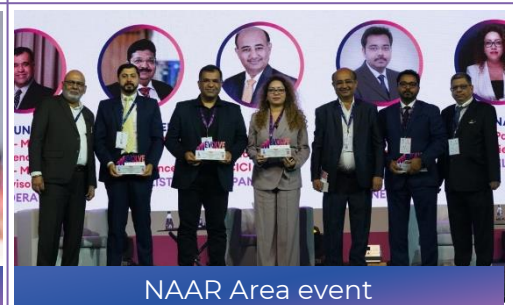
NAAR Area event

We look forward to working with a broad array of partners across the industry as we further institutionalise the Indian residential real estate market and reignite the joy of home ownership and living.